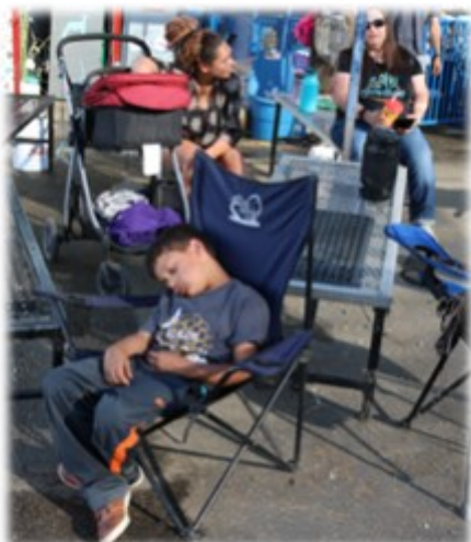
This Black Butte member found that when your day begins at 5:30, a nap is on the agenda.