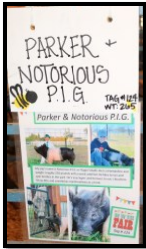
a.k.a. Piggie Smalls