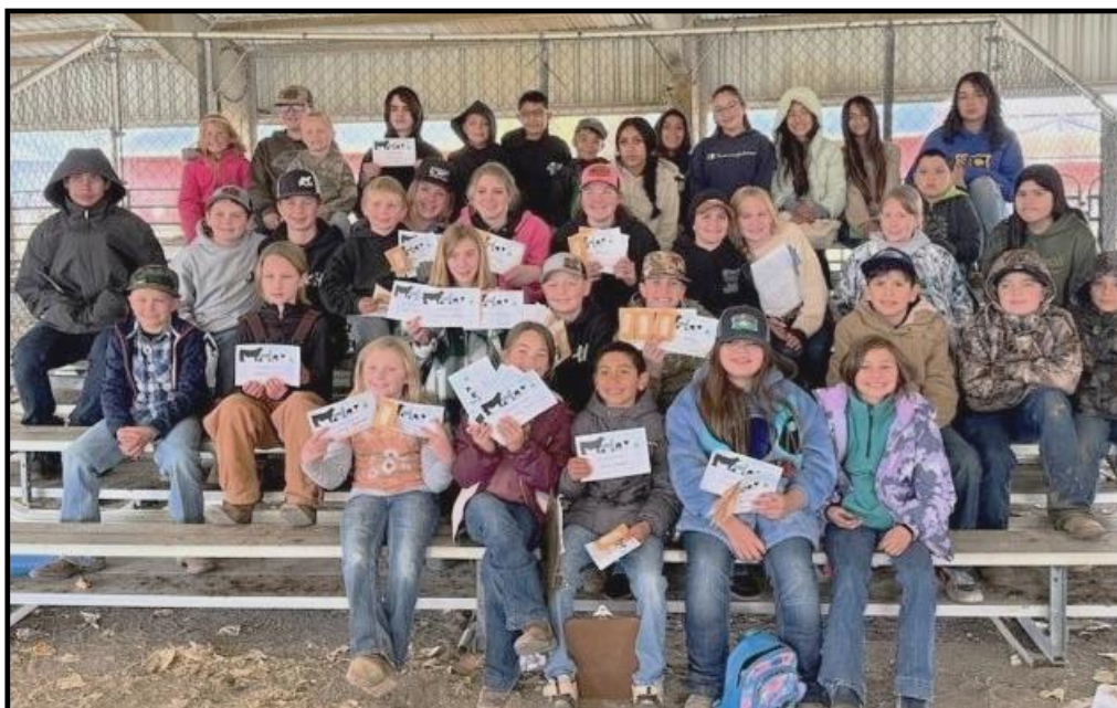
Evergreen was the Spirit Award recipient for Inter-Mountain Livestock Judging 2024