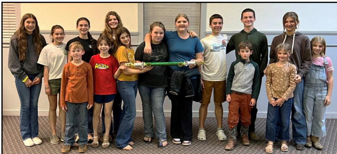
Palo Cedro was the Spirit Award recipient for Valley Livestock Judging 2024

The Spirit Award is a perpetual trophy that is awarded to the club with the most spirit at each event. Sign up to participate in County events so your club has bragging rights for the most spirit at Shasta County 4-H events!