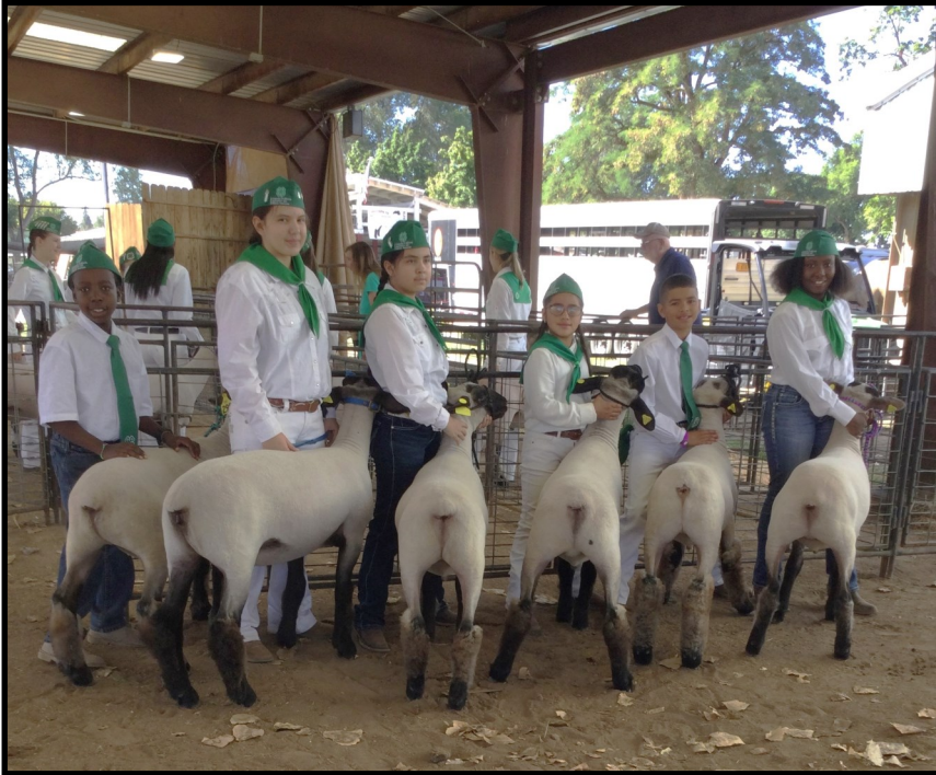
Pine Grove 4-H at the Inter-Mountain Fair 2024