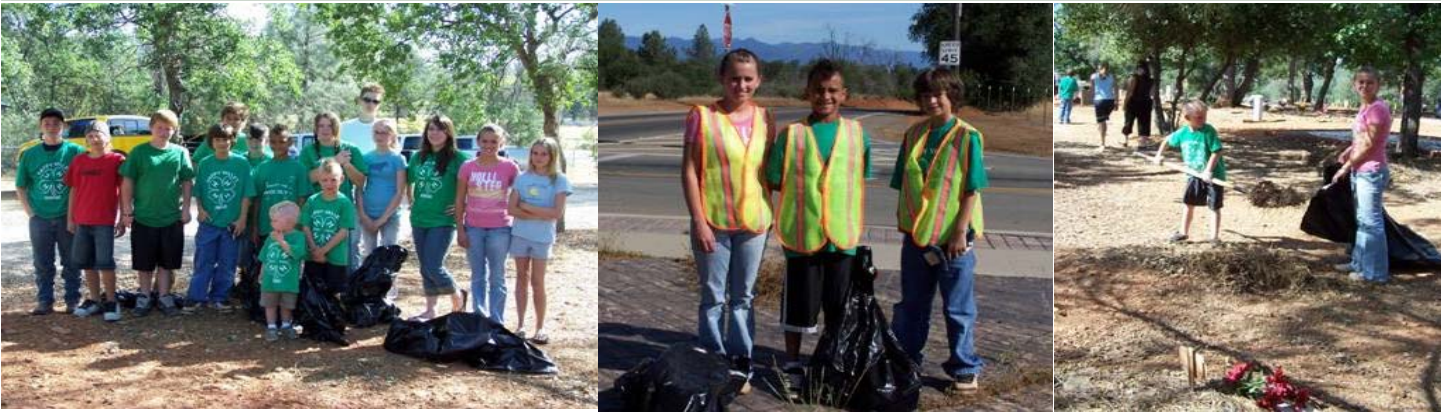
Happy Valley 4-H Club