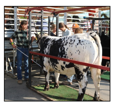
Shasta District Fair