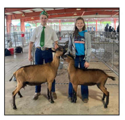
Valley Field Day