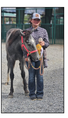
Devil's Garden Colt Challenge