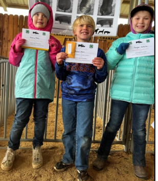
Inter-Mountain Livestock Judging